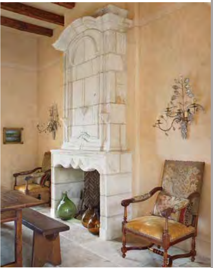
fireplace design & decorating ideas 13

SET IN STONE right Italian glass-and-gilded sconces from the 1940s and antique Louis XVI needlepoint chairs flank a dining room's 18th-century Louis XIV fireplace. A straightforward farm table with bench seating downplays the grandeur of the antique limestone structure. Walls designed to mimic plaster over stone and 14-foot-high vaulted ceilings lend European distinction.